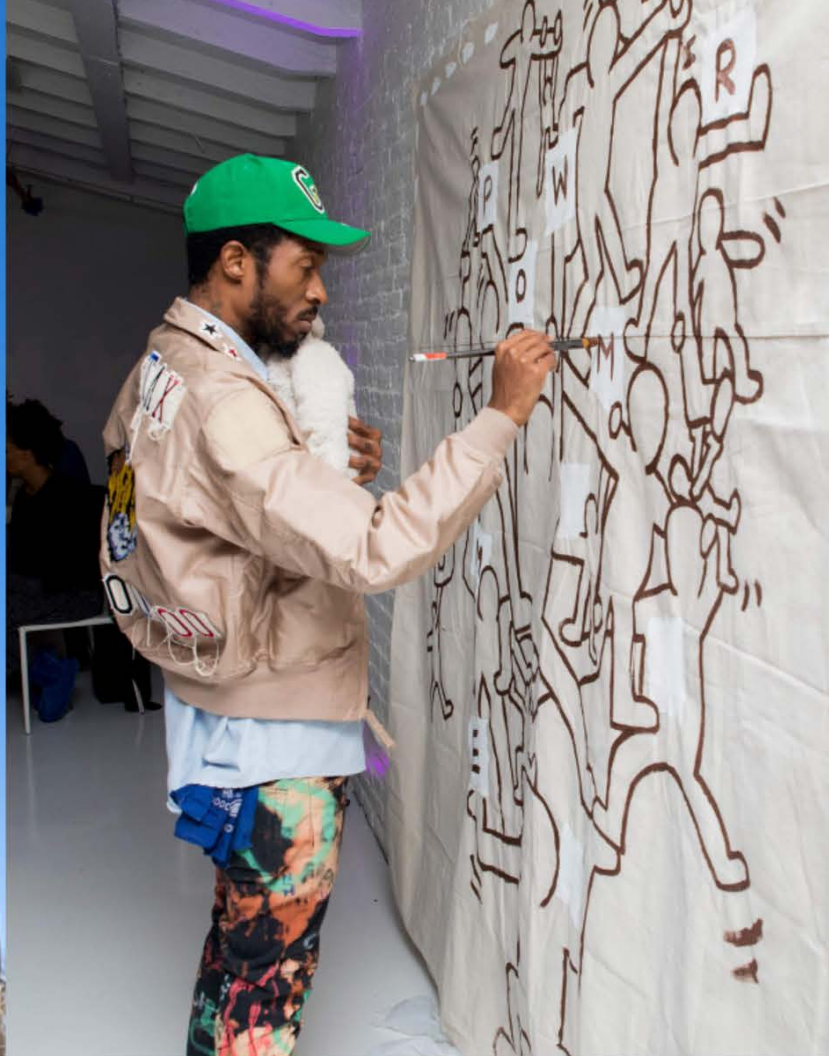
The SLAPcollective's "SLAPFriendsGiving." The SLAPcollective is a Local Arts Support grantee.