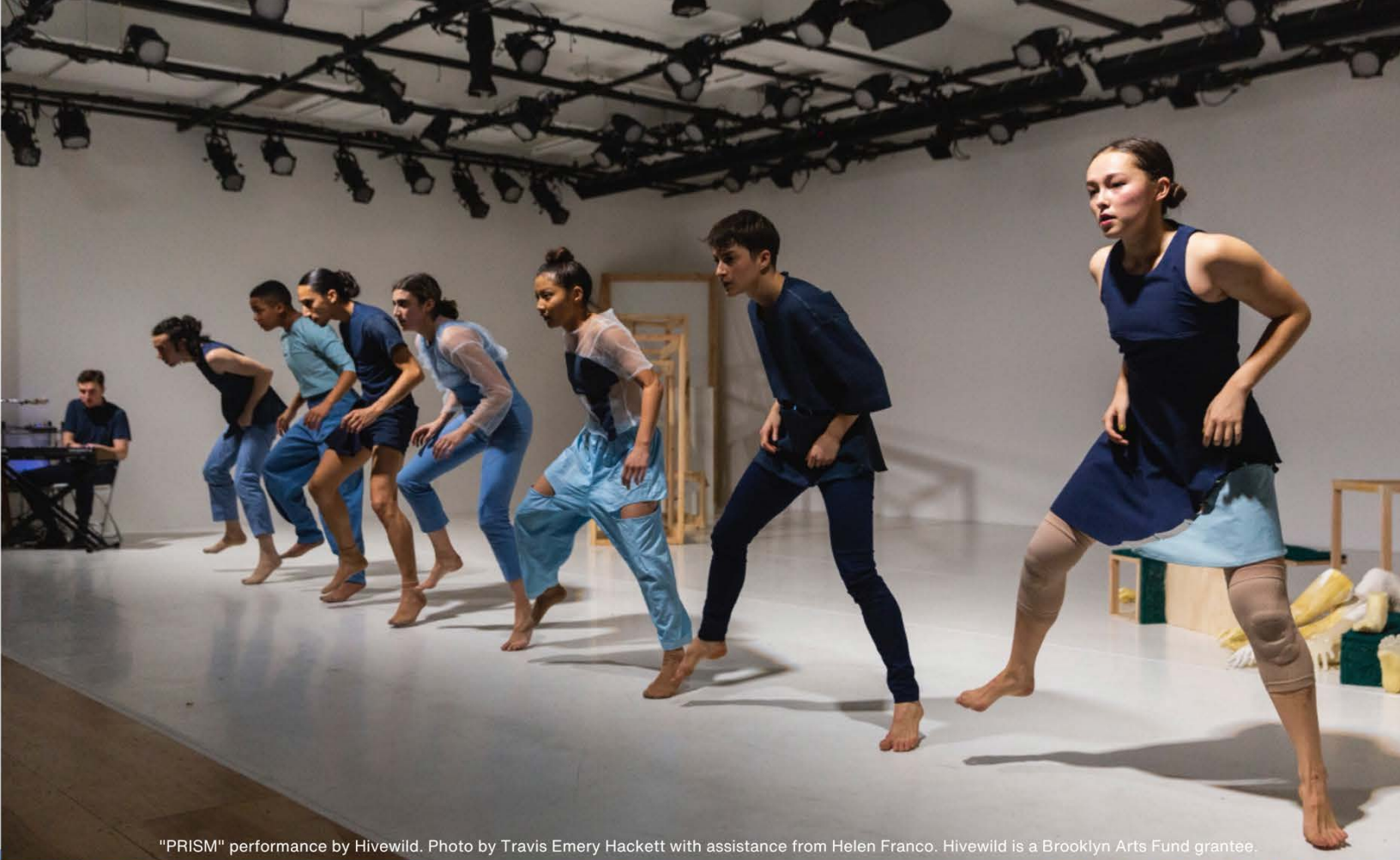
"PRISM" performance by Hivewild. Hivewild is a Brooklyn Arts Fund grantee.